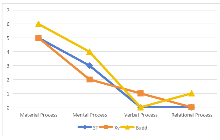
Figure 3 Types of transitivity processes

The first clause above in the ST is verbal process. Budd doesn't notice that, and he render this clause with two clauses. One is relational process and the other one is material clause, both of which have different meaning with the ST. So his translation is not appropriate if seen from the surface meaning. Xu uses the verbal process to translate this clause, and express a correct surface meaning of this sentence.