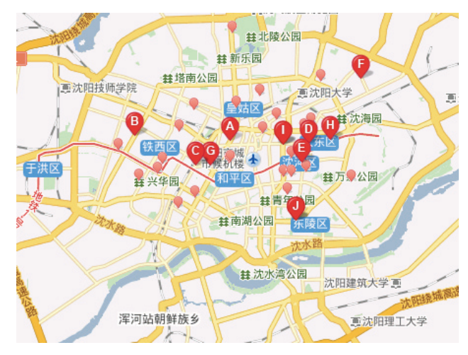
Figure 1 The Distribution of Home Inns Budget Hotels in Shanyang

Since 2006 when the first Home Inns budget hotel was located in Shenyang, Home Inns has already opened 25 branches with a speed of five hotels per year in average. The expansion is continuing. However, there are many hidden problems with such a rapid development. For example, its Jinqiao Road hotel, the Forbidden City hotel, Zhongjie Hotel, and Taiqing Palace hotel are located so closely that you can approach any of them within one or two bus stops. As shown in Figure 1, the Forbidden City hotel, Zhongjie Hotel, and Taiqing Palace hotel are located around E point.