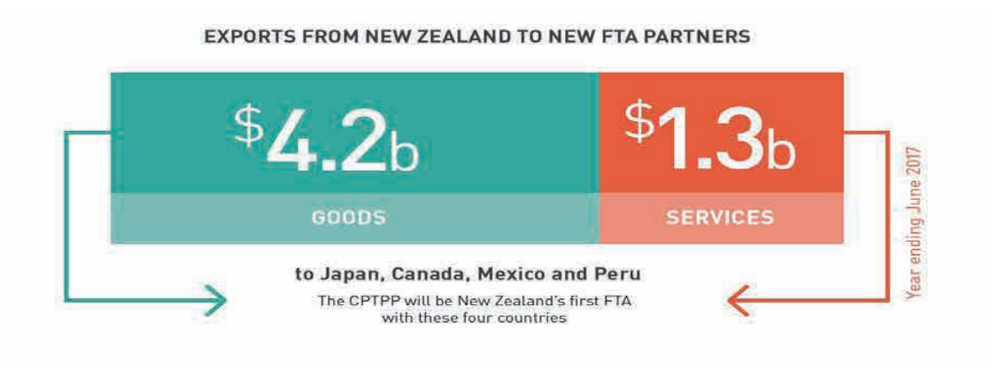
Figure 3 Projected Value Of Exports to New FTA Partners