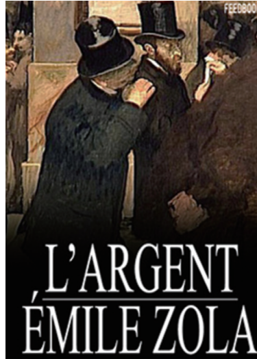
Figure A1 Émile Zola (1840-1902) and His Book