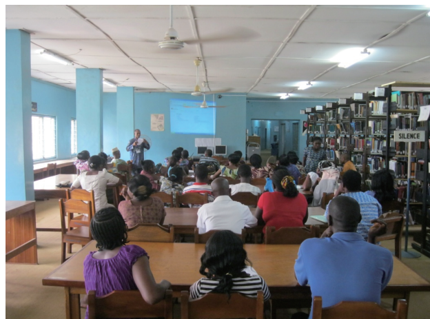
Figure 3 A Cross-Section of Babcock University Library Staff Undergoing Training

In line with the B.U. Library’s policy towards educating users, workshops, seminars, classes, among others have usually been held to educate both staff and students of the University. The approach was seen as impressive as most of the participants commended the librarians for organizing such timely programmes that have put them ahead of their peers in other institutions of higher learning.