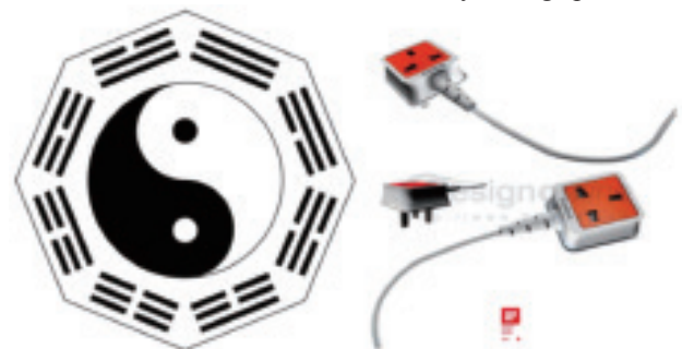
Figure 8 Continue ( Plugs, Sockets Set, IF award )