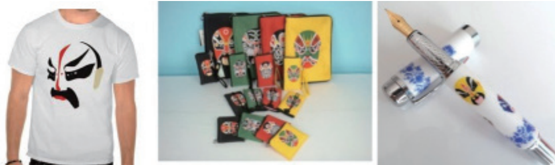
Figure 14 Beijing Opera Face-Painting Products

It is an important branch of Chinese opera culture. Beijing Opera Face-Painting is getting popular at home and abroad and has become one of the signs to show Chinese traditional culture. Beijing Opera Face-Paintings are often applied to some products by Chinese designers. Figure 14 shows some Beijing Opera Face-painting products.