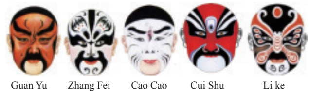
Figure 13 Beijing Opera Face-Painting

Modern product design is deep-rooted in the culture. It has features of diversity and colorful. It is very necessary to combine traditional art with modern technology. Traditional arts can bring designer with art inspiration (Lu & Yang, 2010). Modern designers can use more flexible approach to the design of modern art products. For example, Beijing opera face-painting is made with different colors according to the performing characters personality and historical assessment. Figure 13 shows Beijing opera face-painting.