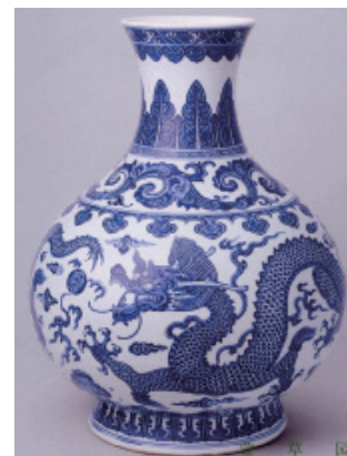
Figure 3 White and Blue Ceramic Vase