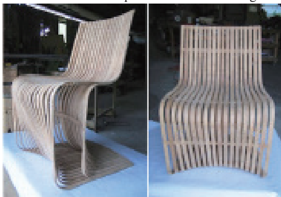
Figure 17 Chair 43