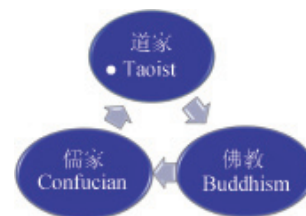
Figure 1 The Main Origins of Chinese Cultural Thought

Traditional Chinese culture is known as one of the world's oldest and complex culture. The culture mainly covers a large geographical region in eastern Asia with customs, nations and traditions varying greatly between countries, provinces, cities, and even towns. As a whole, the main origin of Chinese culture thoughts comes from three parts: Confucianism, Taoism and Buddhism. Figure 1 shows the main origins of Chinese cultural thought.