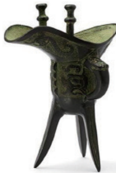
Figure 7 Jue