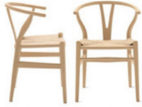
Figure 11 Wishbone Chairs

Traditional folk craftsmanship provides us with a wealth of design elements. People can learn a lot from the decorative arts and design handmade folk art. Designers should be in-depth and comprehensive understanding of traditional culture. Not only learn from the traditional art form, but also to understand the cultural meaning of modeling. Modern designer would inject modern product design that is full of vitality Chinese elements. This is a Zhouzhuang souvenir design. Figure 12 shows the belt. Zhouzhuang is a place where Shen Manzo is a very rich man, but also he lived. Shen Manzo is a Wealth spokesperson. People have dreamed of travelling to Zhouzhuang and taking “fortune” to home. The design offers a sense of “wealthy” to meet the tourists’ psychological needs for “wealthy”. Belt buckle has a shape of ancient Chinese coins to symbolize wealth. Wealthy belt can also be used either as a memorial that can bring wealth to the user.