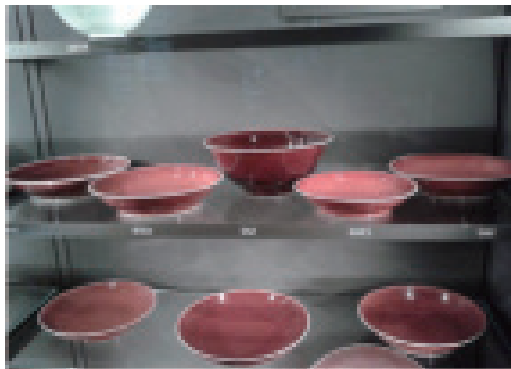
Figure 5 Youlihong

The bottle is a novel. The Centre of the body is the abdomen. There are upper and lower ornaments, each of which faces three layers of lotus petals, layer by layer. The bottle end is also molded lotus petal-shaped. There are seven layers in total. There are ears on the Shoulder. There are a bird and a dragon on the neck. This statue is 66.5 cm in height, 19.2 cm in diameter. It is displayed at the Beijing Palace Museum.