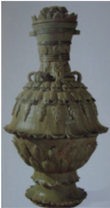
Figure 4 Yang Fu Lotus Porcelain Statue

The bottle is a novel. The Centre of the body is the abdomen. There are upper and lower ornaments, each of which faces three layers of lotus petals, layer by layer. The bottle end is also molded lotus petal-shaped. There are seven layers in total. There are ears on the Shoulder. There are a bird and a dragon on the neck. This statue is 66.5 cm in height, 19.2 cm in diameter. It is displayed at the Beijing Palace Museum.