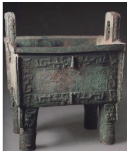
Figure 6 Si Mu Wu Square Ding

glaze, placed at 1,200-1,250°C high temperatures for firing. It is inspired by Song Jun ware and has purple spots under the glaze. Lots of ancient Chinese porcelain designs are full of the charm of traditional Chinese culture. Chinese traditional culture is reflected in products which are used in daily life. For example, Chinese ancient bronze varies from Ding, Jue. Dings and Jues were used as ritual vases and cooking utensils. Figure 6 shows the Si Mu Wu square Ding. Figure 7 shows jue. These bronzes are made by using the lost wax method. They were produced 2000 years ago. These bronzes were designed for both aesthetic and functionality. The excellent ancient Chinese products have brought Chinese culture to all over the world. It is believable all these ancient Chinese products are messengers of East-West cultural exchange. This is to say, the famous Silk Road had spread Chinese traditional culture to the west.