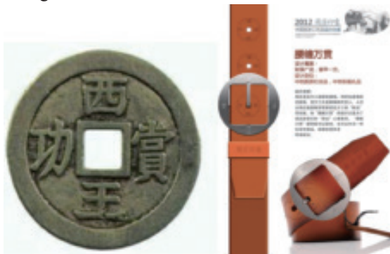
Figure 12 Wealthy, a Souvenir Product

Traditional folk craftsmanship provides us with a wealth of design elements. People can learn a lot from the decorative arts and design handmade folk art. Designers should be in-depth and comprehensive understanding of traditional culture. Not only learn from the traditional art form, but also to understand the cultural meaning of modeling. Modern designer would inject modern product design that is full of vitality Chinese elements. This is a Zhouzhuang souvenir design. Figure 12 shows the belt. Zhouzhuang is a place where Shen Manzo is a very rich man, but also he lived. Shen Manzo is a Wealth spokesperson. People have dreamed of travelling to Zhouzhuang and taking “fortune” to home. The design offers a sense of “wealthy” to meet the tourists’ psychological needs for “wealthy”. Belt buckle has a shape of ancient Chinese coins to symbolize wealth. Wealthy belt can also be used either as a memorial that can bring wealth to the user.