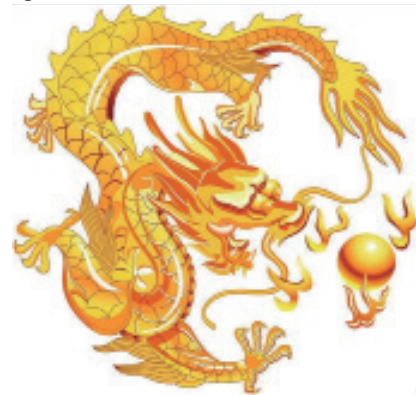
Figure 2 Image of Golden Dragon

It is undeniable that ancient Chinese design has been affected greatly by traditional Chinese culture. Philosophical thoughts and the aesthetic thoughts of Chinese traditional culture have deeply influenced the designer. Thereby, traditional artifacts also brought designers with design inspiration. For example, the Dragon is the totem of Chinese culture. Figure 2 shows the image of golden dragon. During the long years of farming, the most important thing people were looking forward to be good weather. The dragon is God of storm. Chinese people regarded Dragon as the master of the world in ancient time. The Emperor used to call himself a dragon. Chinese people are descendants of the dragon. Therefore, image of the dragon is often used in product design. Ancient Chinese ceramics are the embodiment of which Chinese culture stresses integrity, perfection and harmony. Under the infiltration of Chinese traditional culture, numerous outstanding products have been produced in China. Figure 3 shows a white and blue ceramic vase with dragon patterns on it. For instant, during the period of northern and southern Dynasties, there was a vase with advanced artistic design, also known as Yang-covered lotus porcelain statue. Figure 4 displays a beautiful porcelain craft bottle.