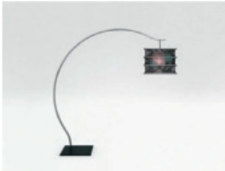
Figure 9 Lantern Lamp

the traditional Chinese Art Deco charm. The first lamp styling was inspired by traditional lanterns. There are bamboo patterns on a second lamp. Wishbone chairs, are also known as Y-shaped chair, which draws styles of chair in Ming Dynasty. All components of this chair are made of batch processing machine. All examples can prove that hybridization is a good way to inherit Chinese traditional culture. According to Rosaldo (1995) hybridization is a tautology, and globalisation has brought about nothing more than the hybridization of hybrid cultures (Georgette et al., 2005).