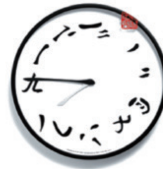
Figure 16 Chinese Character Clock

Chinese calligraphy is one of wonderful traditional culture. It is usually written with ink brushes. Chinese characters are composed of a series of strokes. During the long years, the Chinese art of calligraphy has gradually formed diversities style. Indeed, there is a minimalist set of rules of Chinese calligraphy. Calligraphy was the mediums by which scholars could demonstrate their thoughts and teachings for immortality, and as such, represent some of the more precious arts that can be found from traditional Chinese culture. Figure 16 shows a Chinese character clock. This is a very interesting clock. The hour needle is a Chinese character strokes. When the