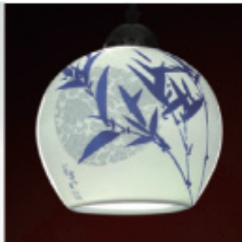
Figure 10 Bamboo Pattern Lamp