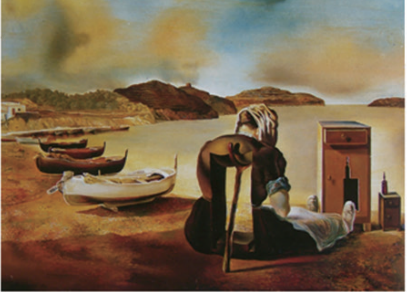
Figure 14 Dali, Isolated Furniture