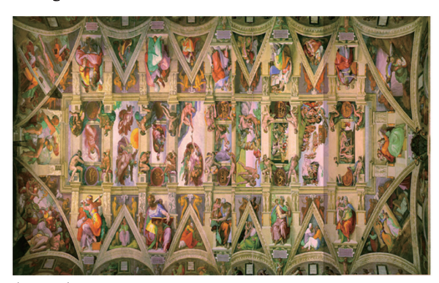
Figure 4 Michelangelo, Genesis

FigureAncient, modern, Chinese and foreign images at different times and places can be shown in one painting. For example, in Genesis by Michelangelo (Figure 4), 7 days created by God according to the Bible story in which God created the world are shown in a large painting of 560 square meters. Extension for a period of time is shown. Although Michelangelo never saw God himself, the painting in which Adam was created by God through blowing is made lifelike and full of vitality with the power of imagination.