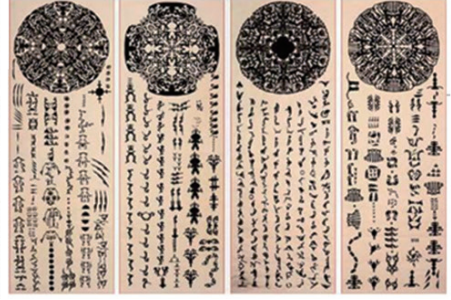
Figure 15 Lü Shengzhong, Valley of Talent Scout