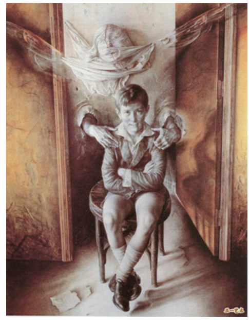
Figure 12 Naranjo, Smiling Masked Man in the Future

both real and unreal. For example, in Smiling Masked Man in the Future by Naranjo (Figure 12), smiling boy, mysterious masked man, wings with blood and hands stretching out from the wall are all seemingly telling us certain kinds of memory. The painting is permeated with misty beauty of illusion.