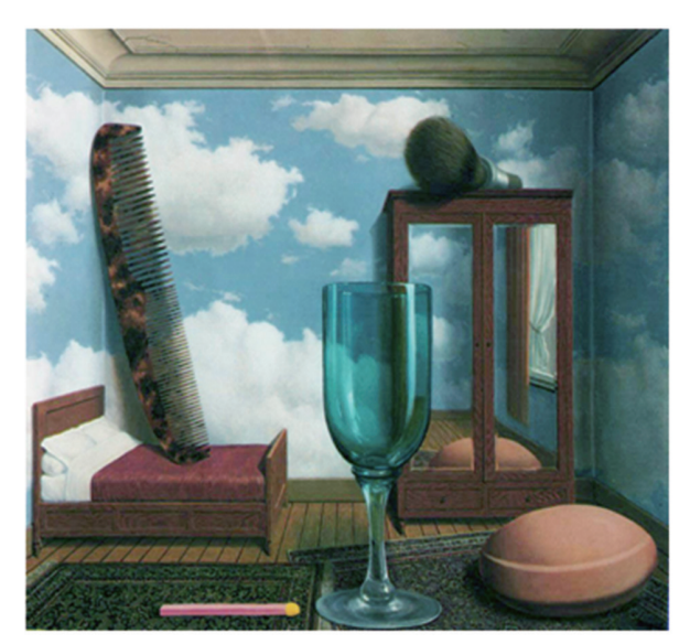
Figure 11 Magritte, Personal Value