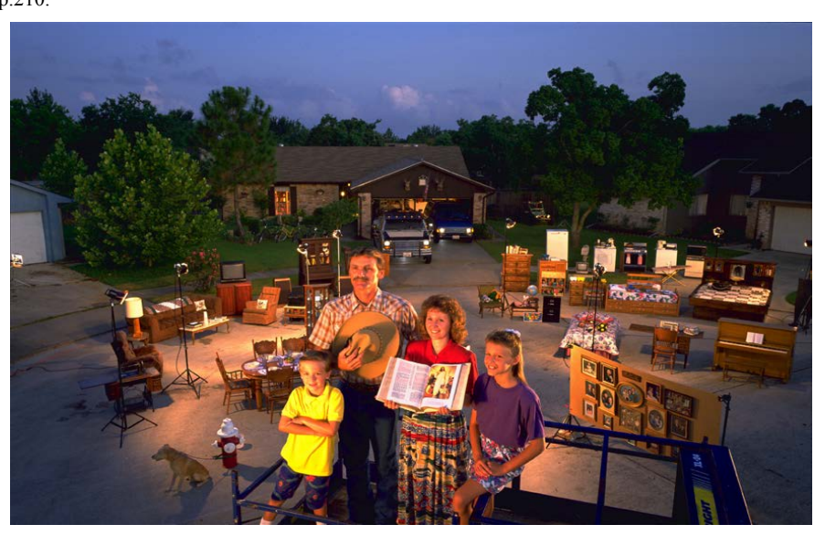
Figure 6 United States: Material Possessions of the Skeen Family

Here, the TV occupies a more marginalized standing because it has been fully incorporated into the living environment, or what Pierre Bourdieu has called the "habitus."