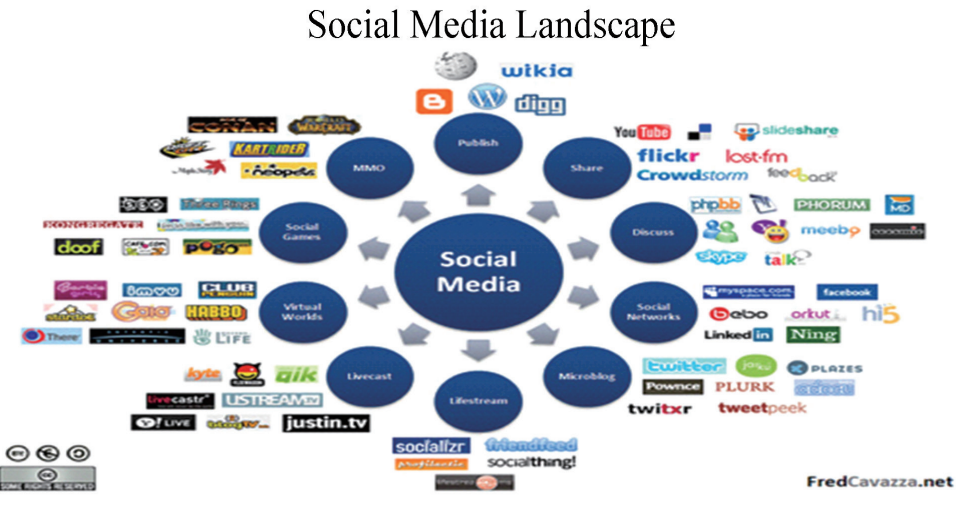
Figure 2 Social Media Landscape