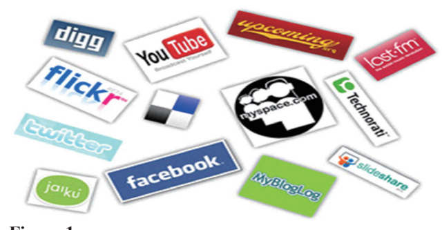
Figure 1 Social Media Tools