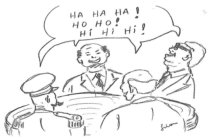
Figure 1 Men Even at Highest Social Status May Resort to Obscene Jokes and Dirty words Among Themselves as A Relaxation (Illustration by the author, himself — s.ç.)