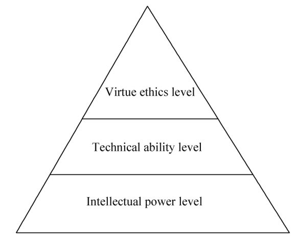
Figure 1 Arrangement of Capability Structure

Capability is always associated with man's practice action while man's mental characteristics can be manifest by accomplishing some activity or in reply to dynamic norms, qualities and effects of the given mission. College students' capability is the individual mental traits that college students can successfully accomplish study and work assignment as well as participate activities like social practices. These traits have a direct influence on the efficiency for college students to finish various practices, the complication and multi-dimension of which then demands that man engaging on practice ought to own varied capability structure in response to the complicated and ever-changing practice action with many levels of ability structure. Then it can be found that capability structure presents the shape of pyramid from below with intellectual power level as the first floor, technical ability level of the second and virtue ethics level the third, as it shown in Figure 1: