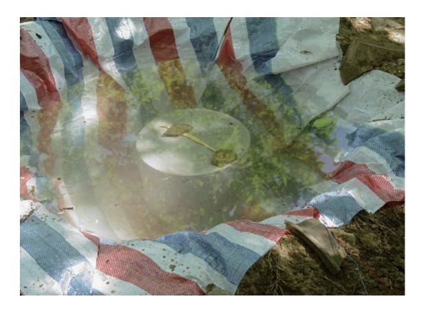
Figure 3 Simulation Experiment in-Situ

There are two reasons for the damage and fracture of the oil-bearing rock by the exploding load, which is yield