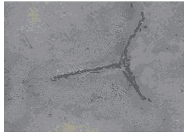
Figure 5 Sample Photo of Three Fractures