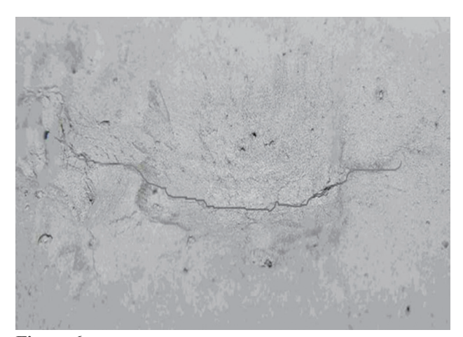
Figure 6 Sample Photo of One Fracture