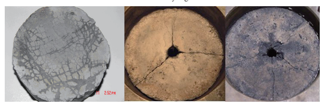
Figure 2 Photos of Rock Damage and Fracture Effect by Exploding

Problem 3: Simulation experiment and high energy gas fracturing experience show that the exploding of explosive can effectively damage and fracture rock. The effect of rock damage and fracture by the exploding wave (left photo) and exploding gas (right 2 photos) are showed by Figure 2.