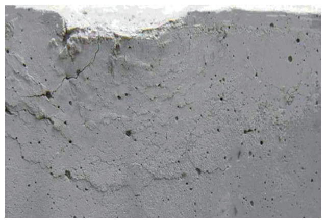
Figure 7 Compacted Damage Zone