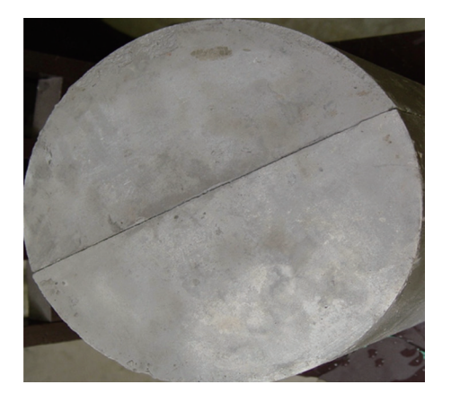
Figure 4 The Sample Photo

In order to observe the inner damage and fracture of the sample, the prefab section was created when the sample is forming (Figure 4).