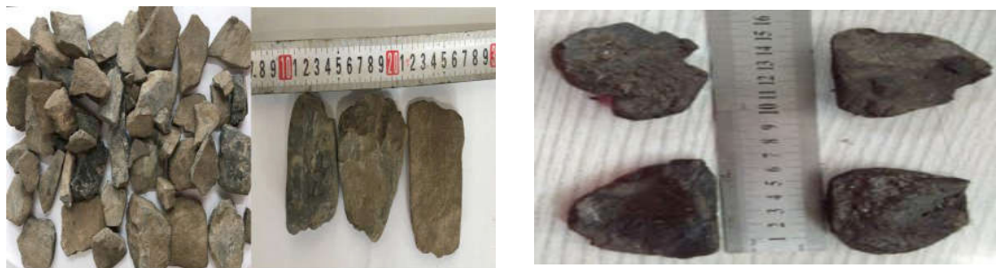
Figure 4-1 The dropped blocks and coal blocks returned by five groups

stabilizer in the drilling fluid is more than 2%. The viscosity of the funnel is controlled within 52-62s, and the water loss is controlled within 5mL. Use solid control equipment, mainly fine-mesh vibrating screen (160-200 mesh), and the performance of drilling fluid in this well section is shown in the following table: