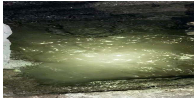
Figure 4-4 Drilling fluid state after 5200m dilution treatment

By adding lime, the stick cut does not drop but rises. At this time, it is recommended to use viscosity reducer, inhibitor or slurry dilution for treatment.