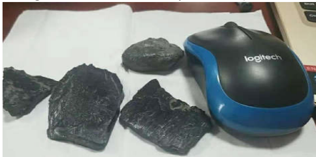
Figure 4-2 The dropped blocks of three sections.

Drilling fluid density control: since there are multiple oil and gas layers in this well section, and the coal and shale layers in the third section are prone to serious collapse and block loss, the drilling fluid density of the second opening is 1.98-2.07g/cm 3 to ensure the stability of the well wall and the safety of well control. (Adjusting the density is mainly based on mixing heavy pulp according to the cycle week. Heavy pulp density and mixing amount need to be strictly calculated).