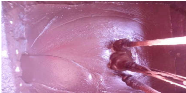
Figure 4-3 The state of drilling fluid treated with lime at 5200 m

should be properly treated to maintain good fluidity of the drilling fluid. When the well temperature is too high, this solution should not be used. CO 2 pollution has occurred.